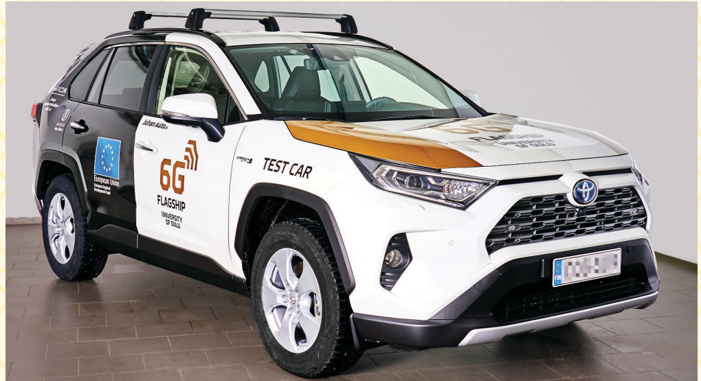
The trustworthiness of 6G technology has crucial implication. The University of Oulu in Finland recently acquired a self-driving car from Toyota to be used as a piece of research equipment where researchers can install their own instruments for testing.

Every opportunity of improving sensing is an opportunity for spying. Trustworthiness for 6G is key.